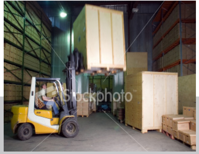
Test forklifts on site. Try out all of the controls and get input from employees who will actually operate the equipment